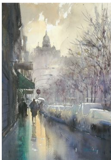
Watercolor by Keiko Tanabe