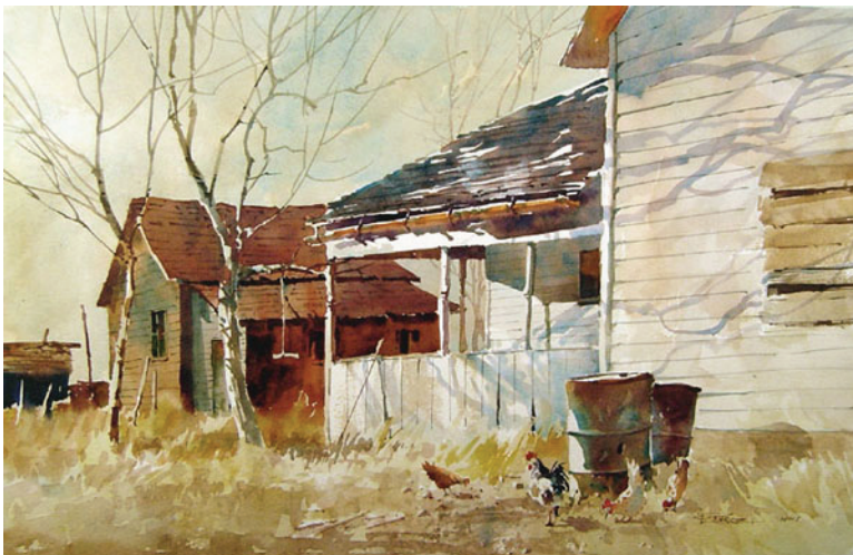
"Chicken Feed" watercolor

Early in his teaching career he developed his own program for teaching drawing, a program that made it possible for every student to identify and overcome the most common problems faced by anyone attempting to draw. That program became the basis for how he would present watercolor workshops, and the foundation for the two books he would later write. He is an enthusiastic teacher who enjoys sharing everything he learns. He has taught drawing and watercolor workshops extensively throughout the western USA and in England and Scotland.