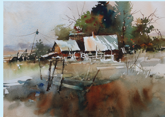
The Old Homestead by Carl Purcell

This workshop is full and we have a wait list.