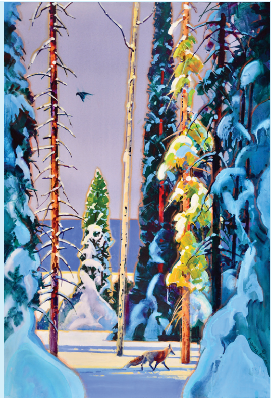
Late Afternoon, Light, Fox, and Raven Series by Stephen Quiller

April 2026 STEPHEN QUILLER Experimental Water Media—Acrylic April 1, 2