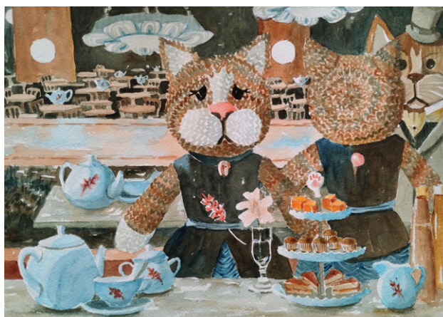
"Knitty Kitty's Teahouse" 14x10, aka A Bar at the Folie Bergere, by E. Manet