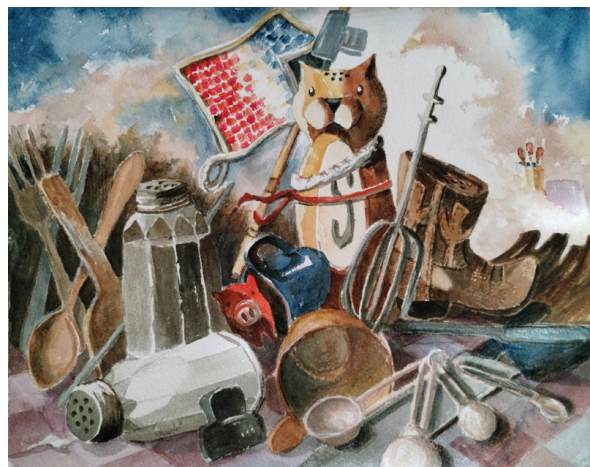
"War of the Salt Shakers" ~13x10, aka Liberty Leading the People by E. Delacroix

I'm very sorry that this is not a class I can point you to, as it was within a California community college seniors program that I was allowed to stay in when I moved to Arizona five years ago. It is, however, an excellent idea and motivation to paint if you are a lover of composition—and maybe a little something of a surrealist!