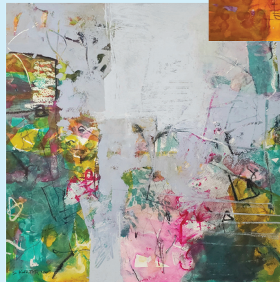
Coastal Anxiety by Stan Kurth

In this workshop, you'll become acquainted with the intuitive painting mindset. You'll begin to shift from a fixed mindset that separates traditional representational painting from abstraction. It is entirely possible to understand and incorporate both approaches in your work. Using various mark-making tools, watercolor, and gouache, lessons will begin without reference or preconceived ideas. You'll create paintings from arbitrary design elements and bring them to completion using principles of design. The goal is to develop a painting that aligns with your personal aesthetic—whether representational or non-objective. The only criteria: no reference, and a willingness to let the process guide the outcome. All three days will vary slightly in process.