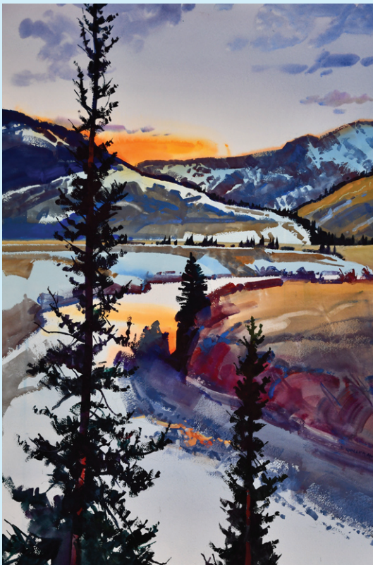
By Stephen Quiller

This two day workshop will be devoted to color theory, color relationships, and color mixing as it relates to various subject matter. Each morning will be devoted to various color studies and in the afternoon a more finished demonstration.